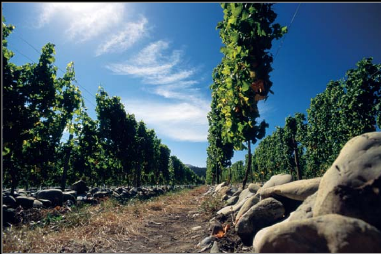
Taylors Pass Vineyard