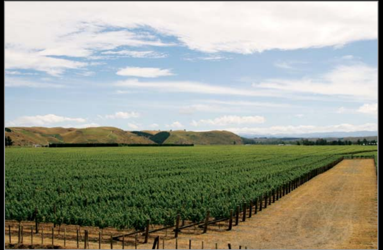
Twyford Gravels Vineyard